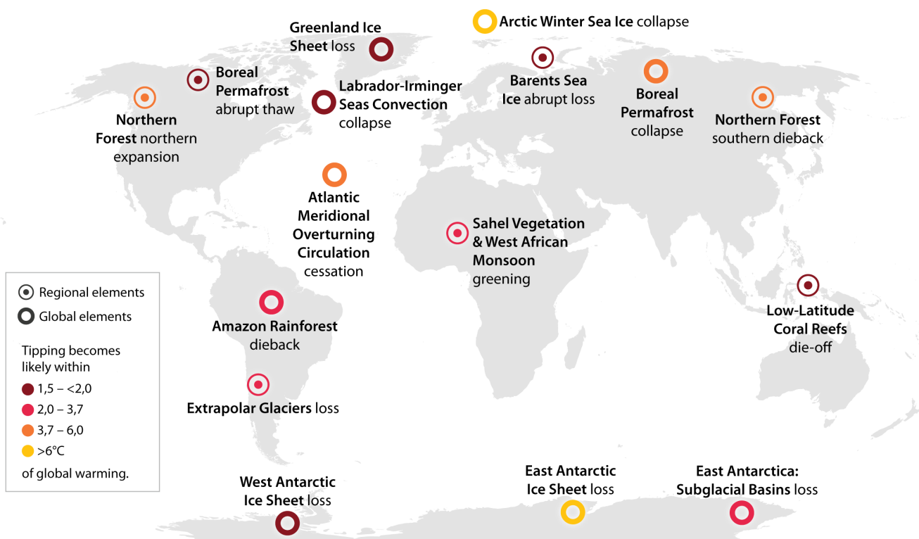
Fig. 1. A map of climate tipping elements, i.e., Earth system subdomains that determine the state of the climate system and are susceptible to dramatic change if global warming crosses threshold values corresponding to their tipping points. The ranges of global warming values where a tipping point is found for a specific tipping element are presented in colors (yellow for <2 °C, orange for 2 to 4 °C, and dark red for \geq 4 °C). The map is derived from Armstrong McKay et al. (6) and printed with permission from the American Association for the Advancement of Science. See SI Appendix, Glossary for key definitions.

Crossing the tipping points will not only have environmental implications as their structure and functioning change (e.g., from stable to erratic regional rainfall) but is also likely to disrupt socio-economic and political systems that have developed with and are reliant on the stability of the Holocene (23). For instance, around 400 million people would directly suffer from a demise of tropical corals (51), and at 3 °C of global warming, over three billion people would be living in regions with health-threatening levels of heat (52). The same is true for the planetary boundaries, which, despite critique (reviewed in ref. 53), are considered precautionary "scientific assessments about what is safe, dangerous and unacceptable" (54, p. 83). Transgressing boundaries and undermining the functioning of biophysical systems already have severe multispecies justice implications for present and future