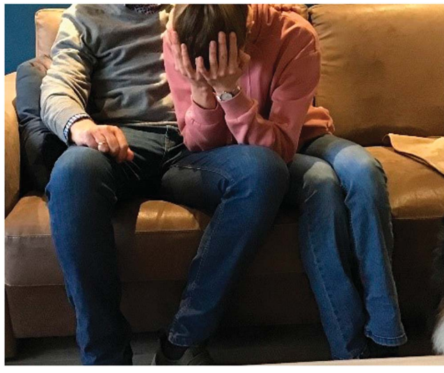
Figure 1. Diary photo of an emotional conversation Participant 1.

A person with aphasia described the effect of complexity of the topic of conversation such as discussions on a complex topic such as politics: