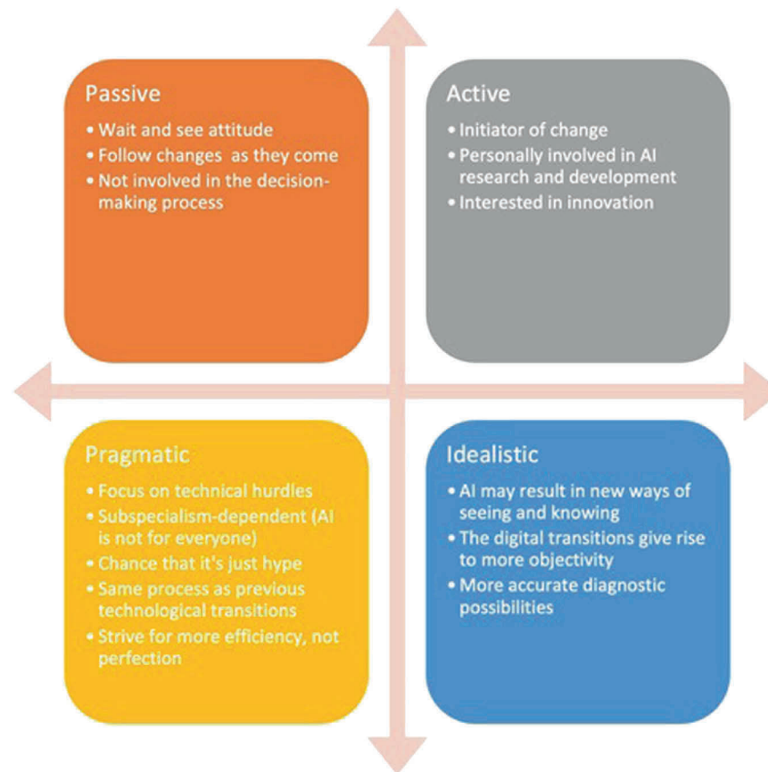
Fig. 1 Positioning of respondents concerning digital transitions.