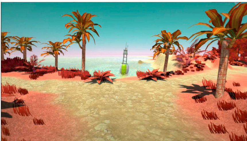
Figure 1. A screenshot of the navigation task indicating one of the eight landmarks in the environment.

The objective navigation assessment was identical to the experimental design described in van der Ham et al. (2020). Participants watched a 69-s movie in which a virtual environment was explored. In the video, a path through a fictitious forest was traversed from a first-person perspective on normal walking speed. The environment consisted out of 8 intersection points (5 two-way intersections, 3 three-way intersections). The stroke of land alongside the path was filled with vegetation and dunes, making it impossible to see previous and upcoming components of the path. Along the path, participants would encounter 8 distinct landmarks (oil barrels, spaceship, science fiction crate, rowboat, car, container, buoy and a formation of crystals) (Figure 1).