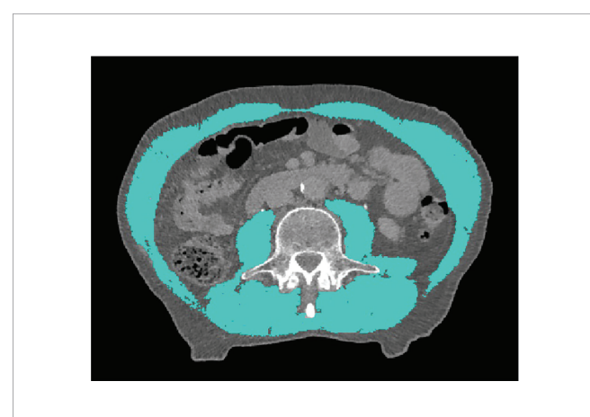
FIGURE 1 | Delineation of skeletal muscle tissue on transversal CT imaging at the level of L3. A Hounsfield Unit window of -29 to +150 was used to accentuate skeletal muscle tissue.

Abdominal CT imaging is not routinely performed in HNC patients and is often only available in patients with locally advanced disease in the context of staging. In 2016, Swartz et al. (28) published an assessment method for SMM using a single CT slice at the level of the third cervical vertebra (C3), which is featured on regular head and neck CT imaging. In this method SMM is assessed at the level of C3 in which both sternocleidomastoid muscles and the paravertebral muscles are segmented (Figure 2). In a next step, a good correlation between CSMA at the level of C3 and L3 was found (r = 0.785). A multivariate formula to estimate the CSMA at the level of L3 from the CSMA at the level of C3 was formulated and included gender, age, and weight; the correlation between the estimated CSMA at the level of L3 and the actual CSMA at the level of L3 was excellent (r = 0.891) (28). This SMM assessment at the level of C3 was recently validated in 200 patients with HNC and showed again a good correlation between CSMA at the level of C3 and L3 (r = 0.75). With the use of the multivariate formula to estimate CSMA at L3 the correlation further improved (r = 0.82). Finally, there proved to be a very adequate agreement between the estimated and the actual CSMA at L3 (interclass coefficient