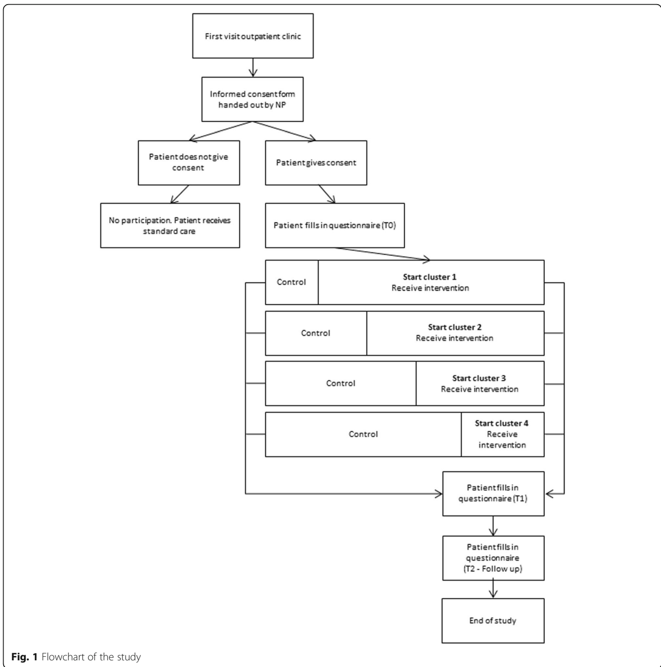
Fig. 1 Flowchart of the study

SMART goal is Specific, Measurable, Attainable, Relevant and Time-based. A global plan of action for goal attainment will be agreed upon. In addition, patients' motivation for change and self-efficacy in relation to the goal will be discussed using visual analogue scales. The second and third session are used to evaluate the progress of goal attainment, facilitators and barriers are explored and if necessary, strengths emphasized and progress complimented, the action plan may be revised. In addition, motivation and self-efficacy will be evaluated and encouraged, alongside a discussion of internal versus external attribution of successes. This means that the