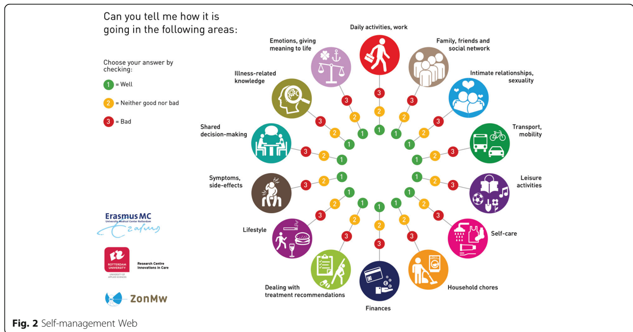
Fig. 2 Self-management Web

intervention background by a psychologist (EM/DB). Both trainers were part of the team who developed the ZENN intervention. The content of the standardized training includes knowledge of the steps in the programme protocol, theoretical knowledge of behaviours change techniques, and practicing these techniques through role-play. NPs learn to activate patients to generate their own solutions rather than focusing on the problems and achieve progression towards personal goals in short space of time. The training consists of two blocks of three hours given on the same day. Due to the COVID-19 pandemic, the possibility of carrying out the training through e-learning and video conferencing is being examined. In addition, there is a booster session once implementation has begun with the aim of discussing cases and optimizing standardization between NPs. The experimental period starts immediately the day after the one-day training has been completed. An extensive description of the training according to the CRe-DEPTH criteria developed by Van Hecke et al. (2020) [38] can be found in Supplement A .