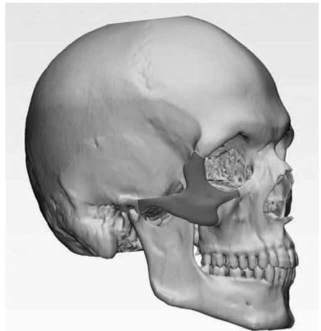
FIGURE 1. Boundaries used for isolating the ZMC surface. Dorsal boundary: articular tubercle of the temporal bone. Medial boundary: orbital midline. Cranial boundary: frontozygomatic suture. Medio-caudal boundary: zygomaticomaxillary suture. ZMC, zygomaticomaxillary complex.

The mirrored 3D-model is then superimposed with the original 3D-model, using the ACF-surface as reference area (Fig. 3C). First, the mirrored ACF was matched roughly with the original ACF on 5 manually placed corresponding points on both objects. Then, the mirrored ACF-surface was matched to the best fit with the original ACF-surface by surface-based matching with an iterative closest point algorithm. A distance threshold of 5.0 mm and 100 iterations were used for the