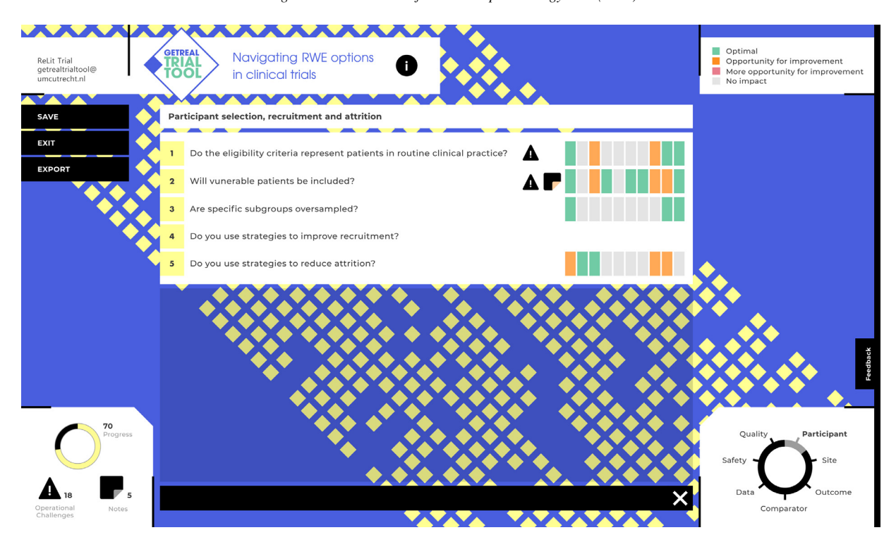
Fig. 3. A snapshot of the main screen of the GetReal Trial Tool.

optimizing the stability of the tool by changing the hosting environment.