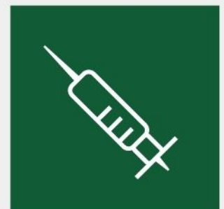
Diabetes & Periodontitis