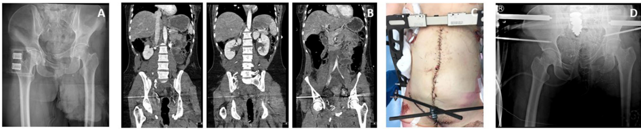
FIGURE 3 | Case of a patient in which a pelvic binder was used in the ED to temporarily stabilize the pelvis (A). After initial surgical stabilization with a supracetabular external fixator and pelvic packing a CT scan was made showing additional injury to the posterior side of the pelvic ring (B). Because of persisting posterior mechanical instability a C-clamp was also used to further reduce the pelvis (C,D) and allow for better control of the pelvic bleeding.

fixator for posterior pelvic injuries when taking into account the anatomical landmarks (21). Unfortunately, this procedure is not frequently used worldwide due to the relatively low incidence of hemodynamically unstable vertical shear injuries, leading to a loss of expertise. Contra-indications for the placement of a C-clamp are severely comminuted sacral fractures, certain iliac wing fractures (crescent fracture) or lateral compression injuries. Its main complications are nerve damage and pin perforation (20, 21).