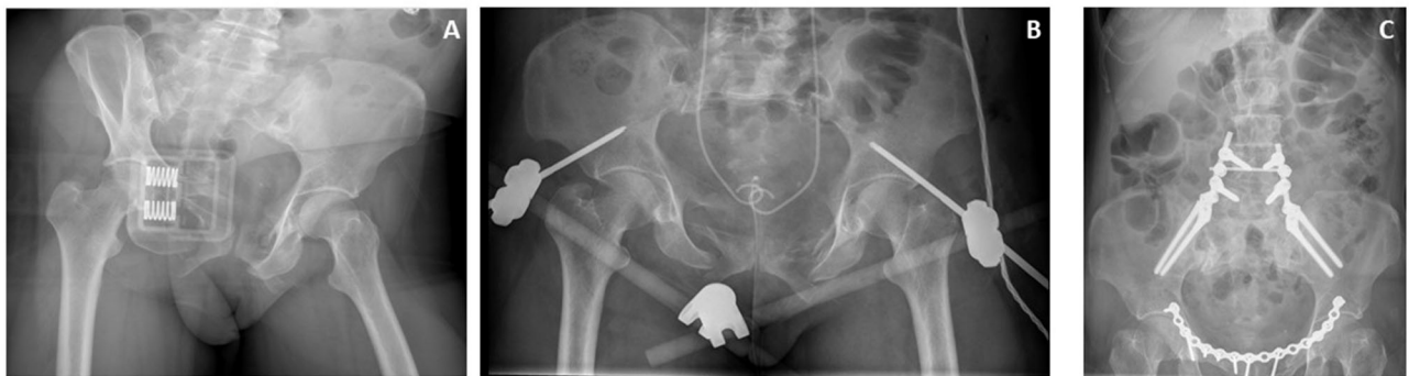
FIGURE 2 | Case of a patient with a hemodynamically unstable pelvic fracture. (A) closure of the pelvic space using a pelvic binder. (B) Supra-acetabular external fixator, and JJ stents after first surgical intervention. (C) Definitive repair including pelvic ring plating, and lumbosacral fixation.