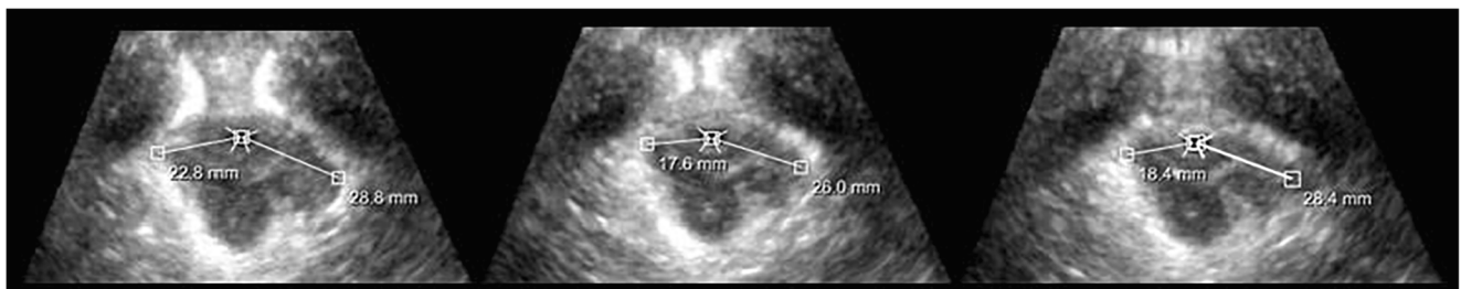
Fig. 3 Transperineal ultrasound of a woman with complete unilateral avulsion showing the three central slices. On one side the levator–urethra gap is <25 \text{ mm} (i.e., intact), whereas on the other side it is \geq 25 \text{ mm} (i.e., complete avulsion)