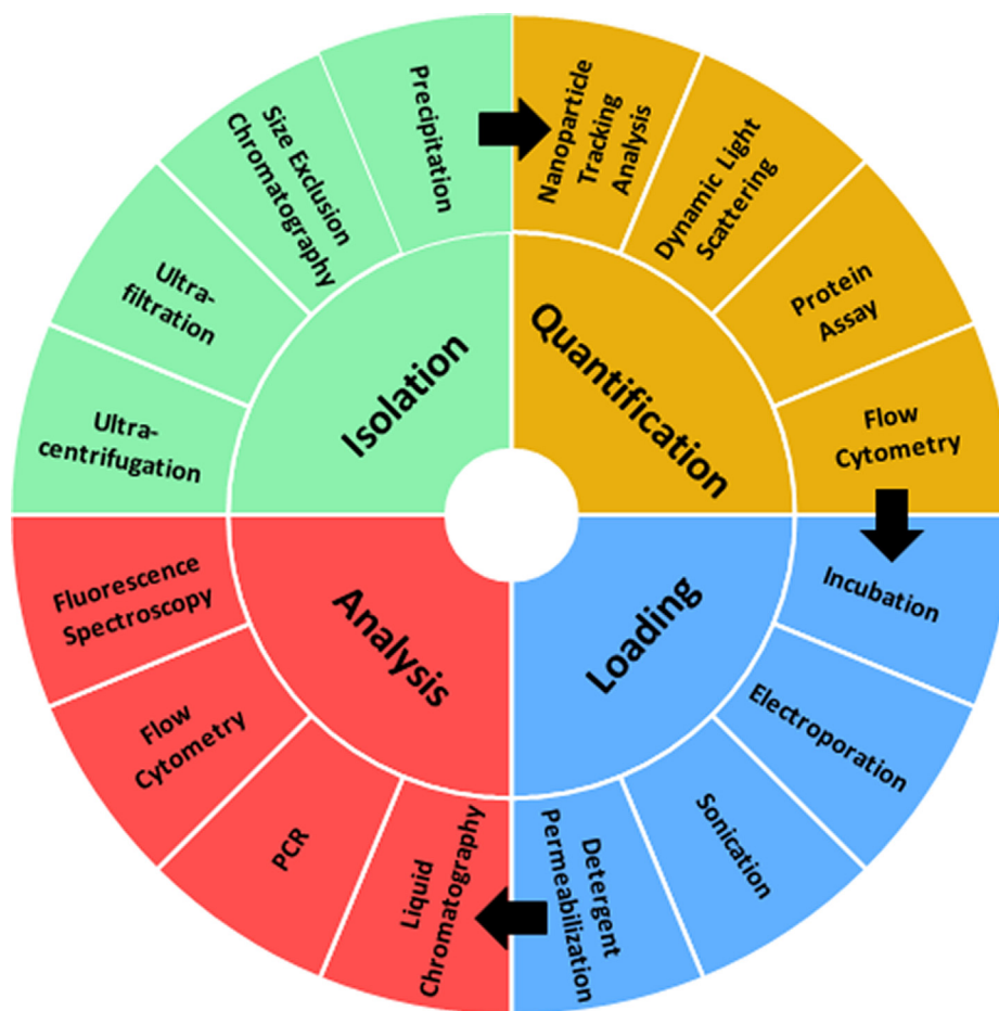
Fig. 1. Summary of the variety of techniques utilised in loading studies for the isolation, quantification, loading and analysis of EVs.