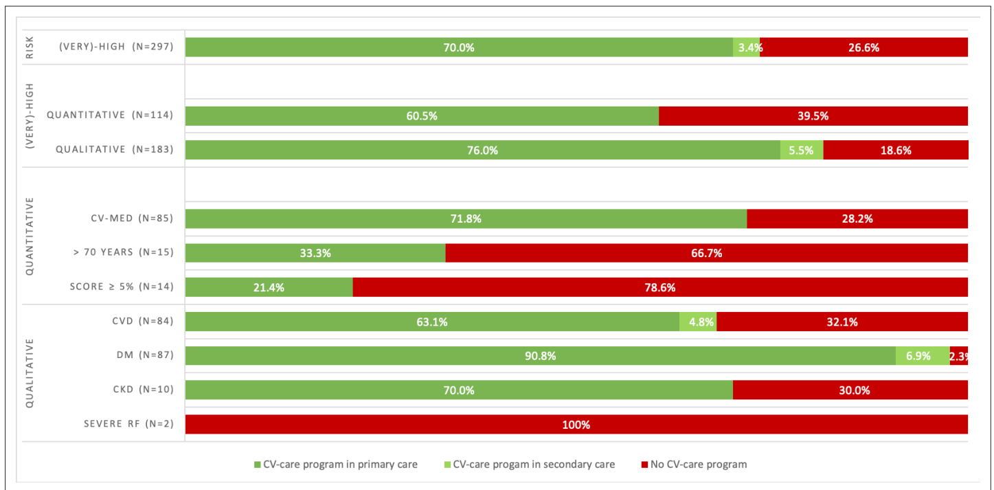
Figure 3 Cardiovascular risk and participation in cardiovascular-care programme of patients with COPD.

CKD = chronic kidney disease. CV-med = cardiovascular medication. CVD = cardiovascular diseases. DM = diabetes mellitus. RF = risk factors. SCORE = Systematic Coronary Risk Evaluation.