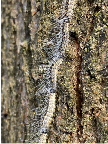
Figure 1. The oak processionary caterpillar. Note the many smaller hair attached to the body.

complaints can manifest as a variety of systemic or local reactions such as respiratory difficulty, ocular problems, sore throats and skin irritation (Rahlenbeck & Utikal 2015).