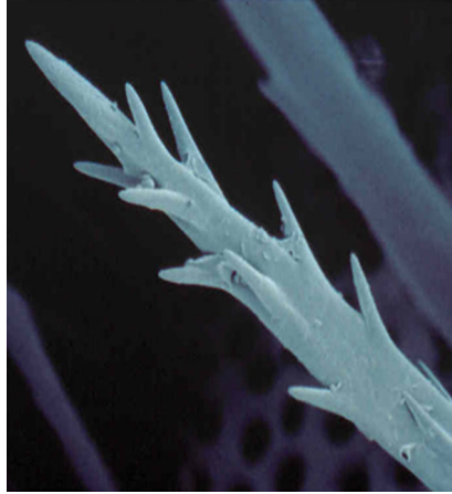
Figure 2. Scanning electron microscope image of an oak processionary caterpillar seta.

Patient A is a 59-year-old, healthy man from the south of the Netherlands. He was struck in the right eye with an unknown object while cycling along an oak forest, known to be infested with oak processionary caterpillars. At the emergency department, only a small erosion was noticed and a bandage with antibiotics was applied. Due to persisting pain a day later, the patient