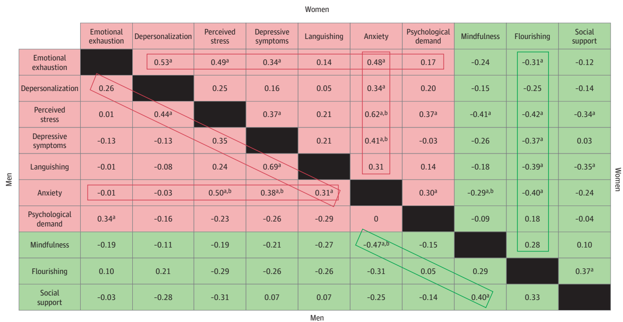
Figure 1. Correlation Patterns Between Risk and Resilience Factors by Gender Identity

Red boxes indicate patterns in individual and workplace risk factor correlation; green boxes, patterns in individual and workplace resiliency factor correlation.