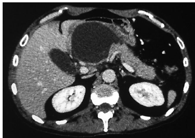
Fig. 1. CT scan of a pancreatic fluid collection in a 63-year-old male 56 days after onset of acute pancreatitis. Ultrasound or MRI is required to exclude the presence of pancreatic necrosis in this collection.

ANC can occur as a result of necrotizing pancreatitis. These collections have both fluid and necrotic components. This can be seen as a more heterogeneous presentation on abdominal imaging (e.g., contrast-enhanced computed tomography or magnetic resonance imaging). The necrosis will develop in the first 3–5 days after onset of disease, and therefore an early scan may underestimate the amount of necrosis. It is therefore advised to perform imaging after 5 days after onset of disease. In the acute phase, it can be difficult to differentiate between a APFC and ANC. It may take 1–2 weeks after initial diagnosis of a fluid collection to make a clear distinction [2, 14]. Necrotic pancreatitis may present as necrosis of the pancreatic parenchyma, usually accompanied with peripancreatic necrosis. In a small group of patients, there will be solely extrapancreatic necrosis (EXPN), without necrosis of the parenchyma. Around 2–6 weeks after onset of AP, the necrotic tissue begins to liquefy giving the appearance of both liquid and solid components in clearly demarcated area (WON) [15]. Hence, the term WON refers to a matured ANC that has well-demarcated and thickened wall between the necrotic and viable pancreatic tissue [2].