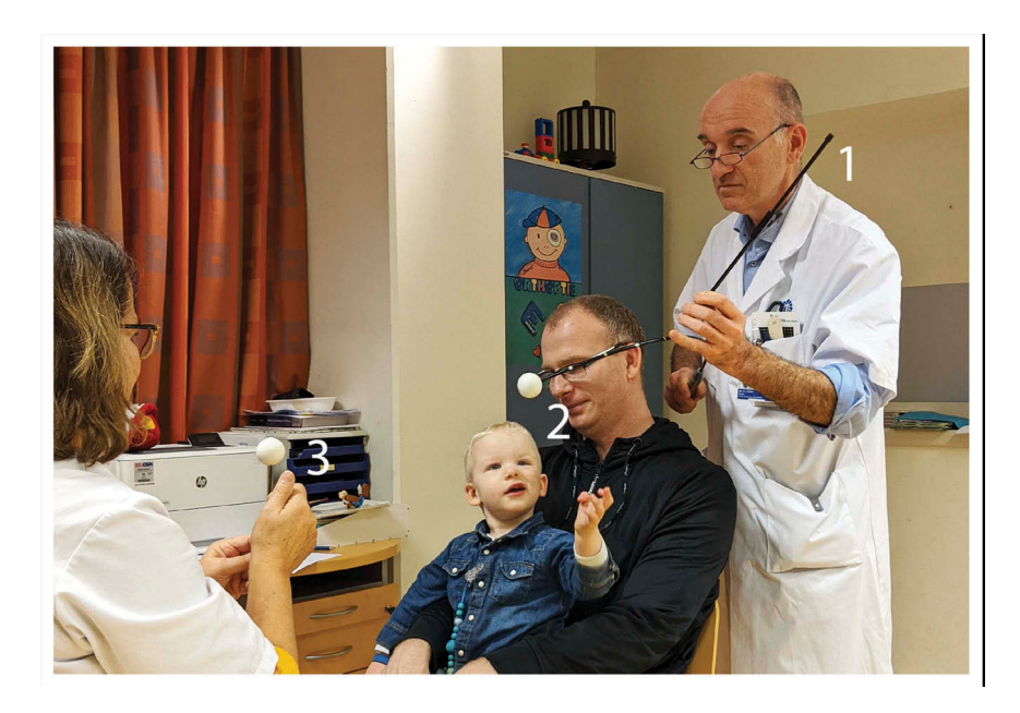
Figure 1. The behavioural visual field screening test. Equipment includes a rod with a level attached to it used for positioning (1), a graded semicircular black metal arc with a white stimulus at the end (2), and a white fixation target on a rod (3).

Due to the retrospective nature of this study, exact protocol times were not listed. All SCP tests took approximately 30–40 minutes with breaks included. As soon as SCP was possible for a child, they were tested with the CP or an SCP test with periphery, if it were possible. The treating ophthalmologist chose between Goldmann, FFP and HFA.