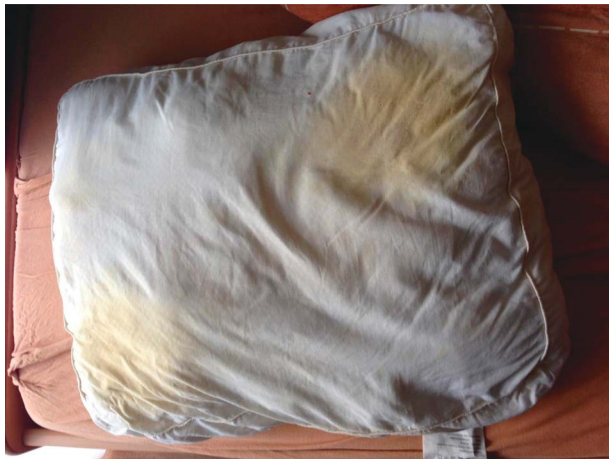
FIGURE 1. Saliva stains on a pillow as a result of sialorrhea.

Suspected drugs are classified in Vigibase according to the Anatomical Therapeutic Chemical (ATC) classification.