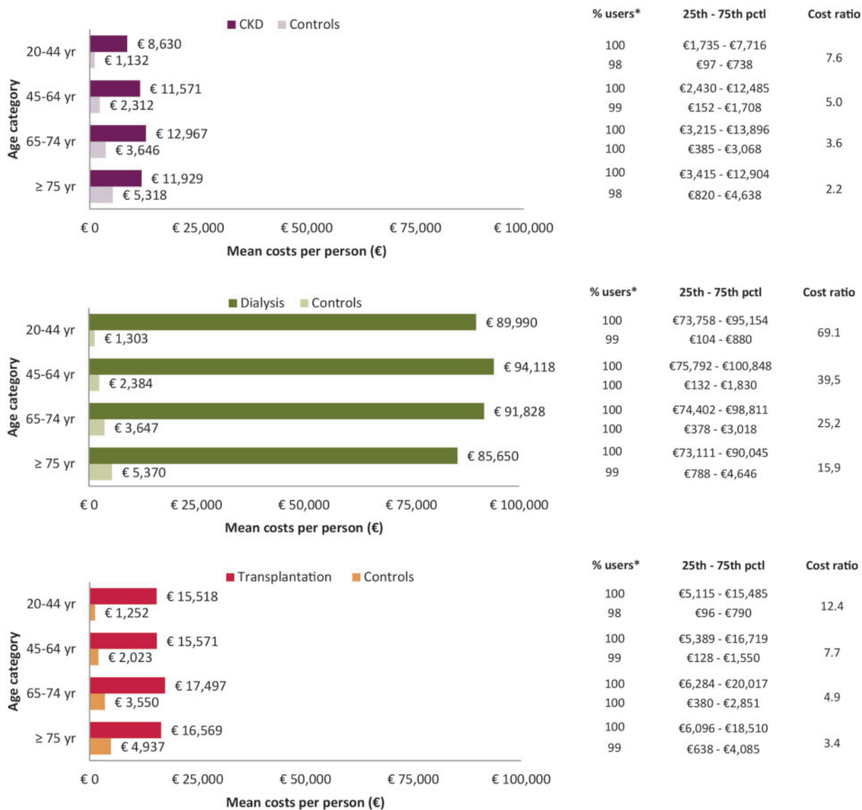
FIGURE 1: Total annual health care costs of CKD Stage G4/G5 not on RRT, dialysis and kidney transplant patients versus matched controls. *Denotes the percentage of users per group that incurred costs for care in that specific cost category.

Surgery. Twenty-nine percent of young dialysis patients and 40% of elderly patients needed surgical care versus 5 and 12% of controls, respectively (Supplementary data, Figure S3b). In the oldest dialysis patients, this was 35%. For both CKD Stage G4/G5 and transplant patients, surgery costs were lower for patients ≥75 years of age than for patients 65–74 years of age.