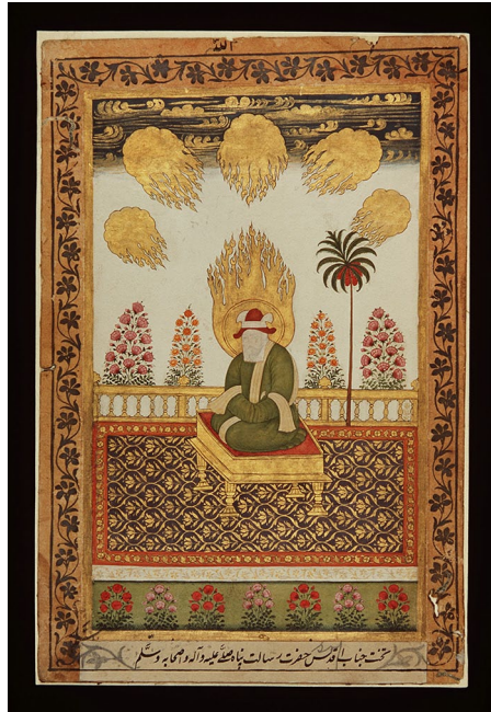
Figure 1. Miniature painting depicting the Prophet Muhammad enthroned, c. 1800, Kashmir, India. Reproduced courtesy of The Netherlands National Museum of World Cultures, RV-2871-4.

In 2015, months after the attacks on the satirical magazine Charlie Hebdo , I was asked to translate the Persian text at the bottom of the image, which until then had been described as ‘probably a prophet’, made in India circa 1800, while the inventory card suggested it is ‘the Prophet.’ 9 Indeed, the calligrapher’s text clarified that it was not just any prophet or sage depicted on a throne, as a learned man would be in the Mughal Empire. It was Muḥammad, reading in Persian ‘The Throne of His Excellency, His Highness the Protector of the Prophecy’, followed by an Arabic salutation that doubly confirms the Prophet’s identity, ‘may Allāh grant honor and peace on him, his family, and companions.’ 10 The Prophet is also recognizable by his flaming halo, veiled face and the date tree in the back, one of Muḥammad’s attributes. Above him float another five flaming halos, possibly a Shi’ite reference to the Ahl al-Bayt or people of the house, the family composed of the Prophet, ‘Ali, Fāṭimah, and their sons Ḥusayn and Ḥasan.