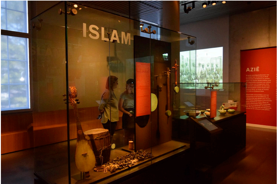
Figure 2. Asia Room displaying Meccan musical instruments. National Museum of Ethnology, Leiden.

image-condemning Hadith, museums, universities and the press thus become involved in theologizing and risk reproducing a fundamentalist understanding of Islam. For this reason, rather than reducing Islam to the text, Ahmed (2016: 53–54) presents works such as the 16th-century Canon of Figural Representation (Qānūn-uş-Şuvar) that he believes are better suited for grasping the historically accumulated meanings of miniature paintings produced in the Balkan-to-Bengal complex. Likewise, in contrast to her short and simple answer, Gruber presents a long and complex answer in her book The Praiseworthy One (2019), citing a great variety of comparable texts to decipher images of the Prophet made throughout the centuries.