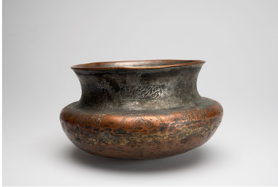
Figure 4. Wine bowl inscribed with verses of the poet Hafez, 19th century (disputed), Herat, Afghanistan. Reproduced courtesy of The Netherlands National Museum of World Cultures, TM-3964-8.

sharāb-khwurdan ), which, argues Ahmed, shows that Tūṣī, like Avicenna before him, was part of a context in which drinking was a normal and normatively praised practice, so much so that it required a text on the etiquette of intoxication. We can make sense of these Muslim drinkers if the central place of philosophy and poetry in the Balkan-to-Bengal complex is taken into account, for which ‘the Qur’an is of essence and nature and being not the highest (accessible) form of truth’ (p. 257). In Ahmed’s account, drinking is made an Islamic act through a pre-modern epistemological hierarchy (ch. 5). For those who could access Revelation by means beyond the Qur’an, physical and metaphorical drinking accompanied by Sufi poetry, which playfully builds on Islamic references, formed a bridge to the divine, or the Unseen. An undocumented metal bowl (Figure 4) I found in the Tropenmuseum collection allows me to briefly illustrate how Ahmed’s perspective is derived from the material expressions of this tradition and changes how we see their place (or absence) in exhibitions.