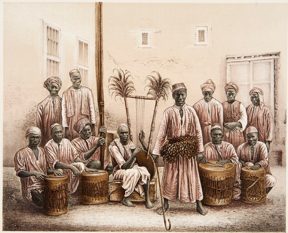
Figure 3. Lithograph depicting a tañbūra orchestra in the Dutch consulate in Jiddah, 1888. Reproduced courtesy of The Netherlands National Museum of World Cultures, TM-60057094.

a theological stance. Former curator Mirjam Shatanawi said in 2016 that she thinks the museum's central mission should be to inform visitors that there are images of the Prophet at all and that Meccans do listen to music, not just in the age of the Internet, but also in the past.