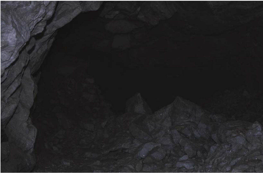
Figure 2. Pieter Paul Pothoven, Main Mine, Adit #2 , from the series In Absentia (2010).

writes, is “a reminder of the condition of the mine workers, who risk their lives in their daily journey up the mountain to go into the belly of the mountain to blast, drill or cut out its blue matter with very simple tools and in unsafe conditions.” 39 The absence of blue and depiction of the empty mine is representative of the dark side of the idolization of the color blue that Pothoven’s work draws attention to. The disruptive nature of Giotto’s blue is doubled as blue mountains and mines make way for the post-9/11 “geopolitical fetishism” of the terror hiding in Afghan caves. 40 In Absentia makes visible the capitalist extraction of the lapis lazuli rock and the human cost of ripping the blue out of the mountain, and the literal darkness that has taken over Sar-e-Sang now that much of the lapis lazuli has disappeared. Yet it also visualizes the imagined darkness of the cave in the early twenty-first century. The mountain, the cave, the rock, the pigment, the ship, the navy, and the military are part of the blue colonial threads that are woven of blue material and its remnants across thousands of years.