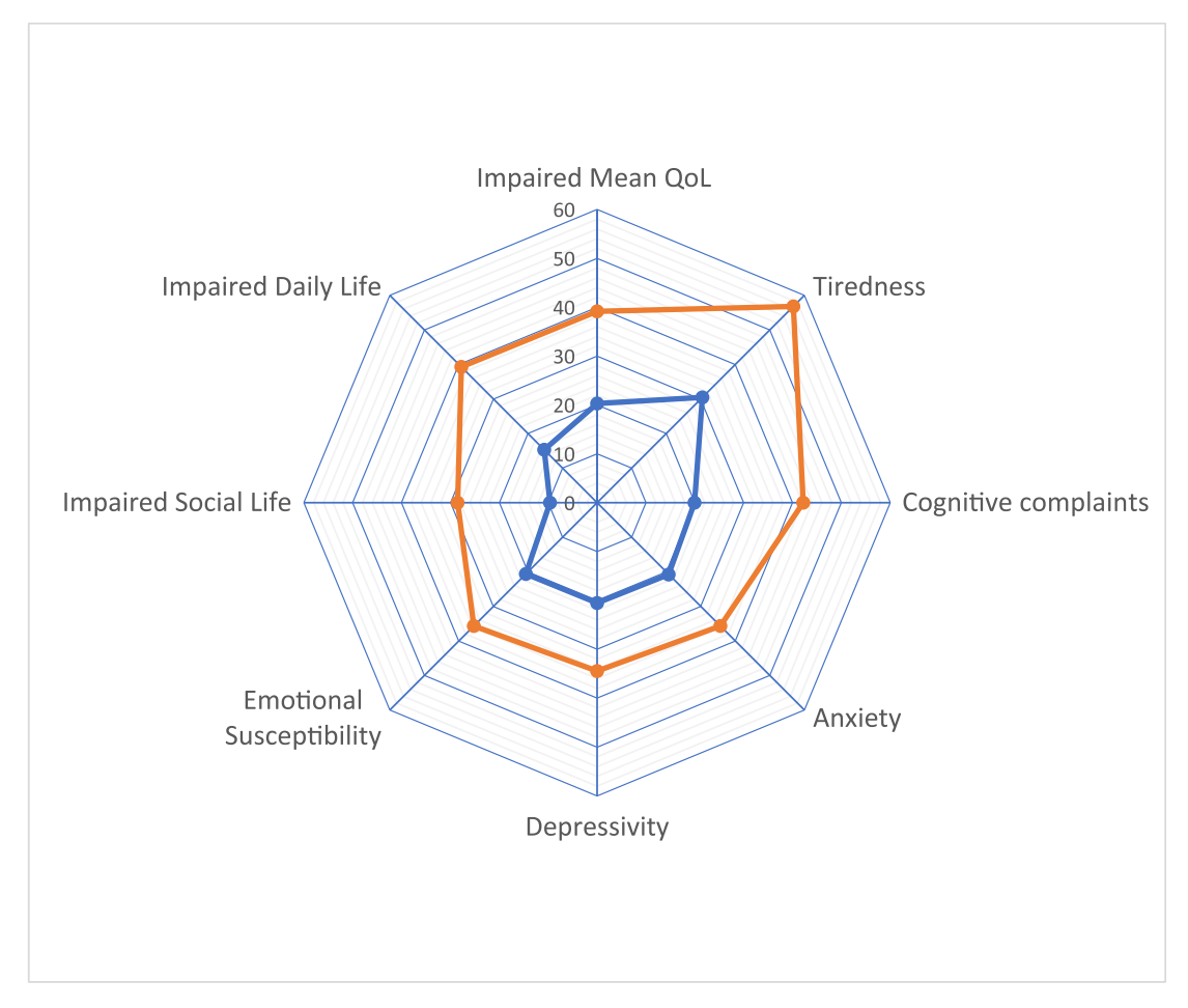
Fig. 1. Quality of Life (QoL, using the ThyPRO, expressed as means) in treated hypothyroid patients (orange, n=1195) and controls (blue, n=240). Mean QoL and all domains were significantly more impaired in hypothyroid patients as compared to controls (p<0.001). Orange = hypothyroid patients (treated with thyroid hormone), Blue = controls. (For interpretation of the references to color in this figure legend, the reader is referred to the web version of this article.)