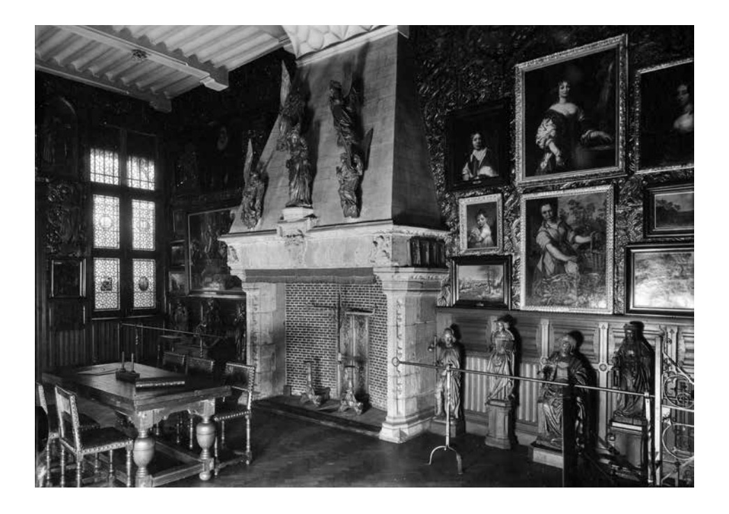
Fig. 1. Early 20th-century photograph of the interior of Museum Mayer van den Bergh (coll. Museum Mayer van den Bergh, Antwerp, MMB.F.276)

sorts of visitors with the clear intention to 'educate the public'. Where the public museum relates to the emerging bourgeois culture in nineteenth-century Europe, collection museums were often connected to conservative and aristocratic values, at a time when aristocratic power was quickly diminishing.<sup>2</sup>