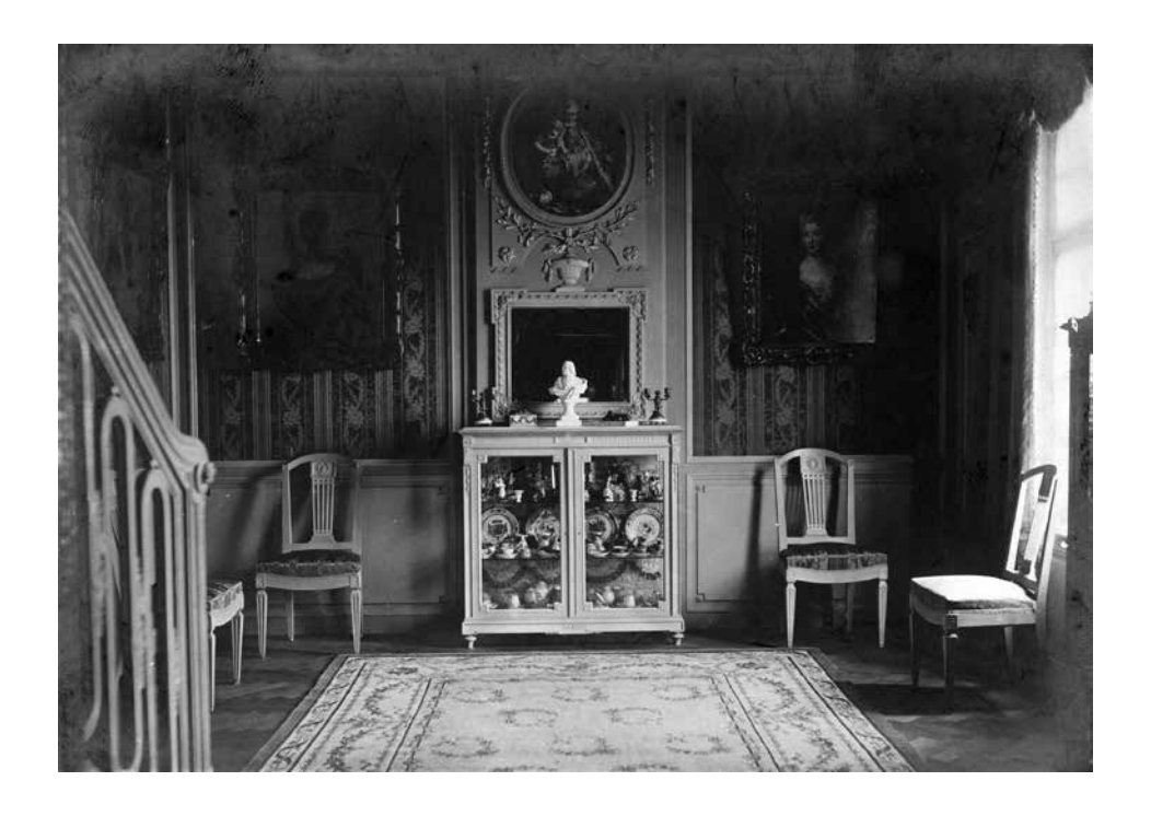
Fig. 4. Photograph of the Louis XVI-room, the final room in the Mayer van den Bergh visit

the De Borrekens family and many other important noble families.<sup>53</sup> The book also includes notes from important clerical figures in Antwerp, such as Henri Rommel, canon of the chapter of St Salvator's, and well-known Catholic politicians such as Baron Gaston van de Werve de Schilde, who would later become governor of Antwerp. Absent are prominent members of the Liberal city government, and Henriëtte also kept the museum doors shut for a lower-class audience. When asked if she intended to open her museum to the public, she answered: