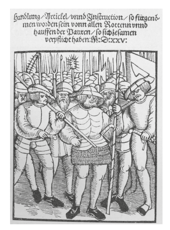
Fig. 1: Unknown, "Titelblatt 12 Artikel" ("The Twelve Articles") (March 1525), Wikimedia Commons (from: Otto Henne am Rhyn, Kulturgeschichte des deutschen Volkes , Zweiter Band, Berlin, 1897), https://commons.wikimedia.org/wiki/File:Titelblatt_12_Artikel.jpg. This image shows the front cover of the Twelve Articles (also known as the Memmingen Articles of War) that articulated the peasants' demands during this powerful 16th century rebellion. The cover page shows German peasants armed with an assortment of intimidating home-made weapons.