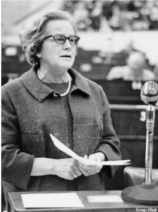
Figure 1 – Käte Strobel during a session in Strasbourg, May 1965