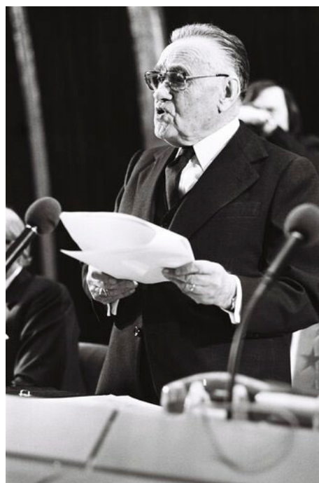
Figure 2 – Marcel Brégégère during a session in Strasbourg, February 1978