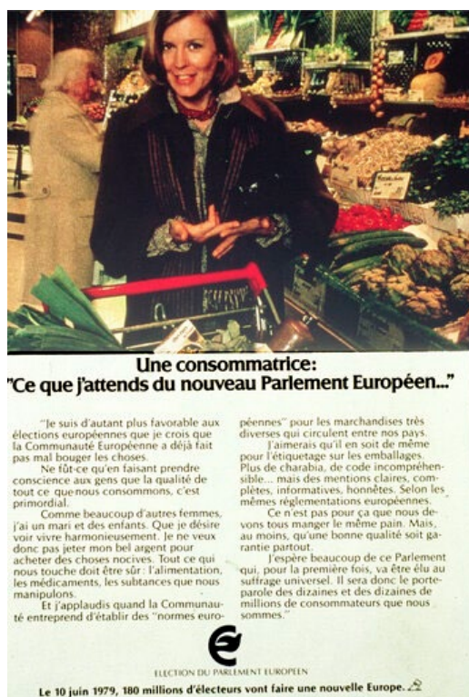
Figure 3 – Poster published by the European Commission and Parliament for the 1979 European Parliament elections