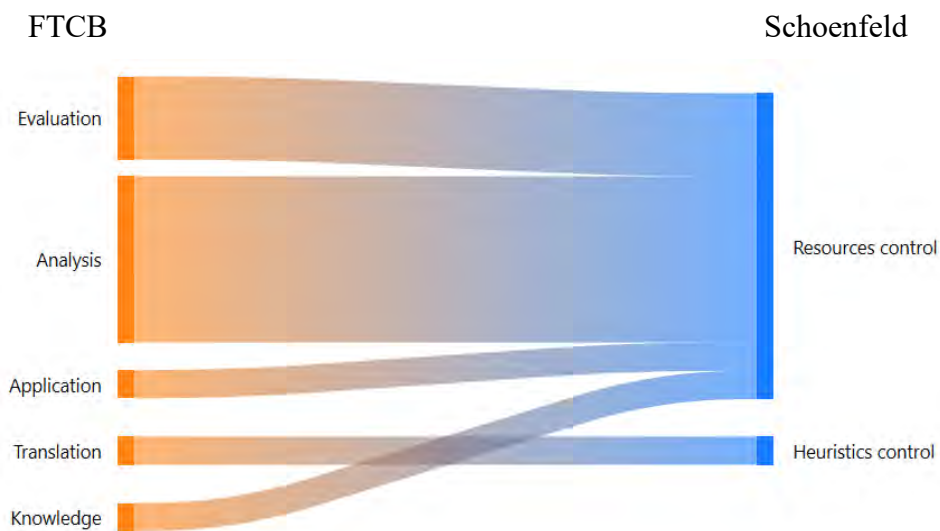
Figure 3: Co-occurrence between the two control codes and five FTCB codes