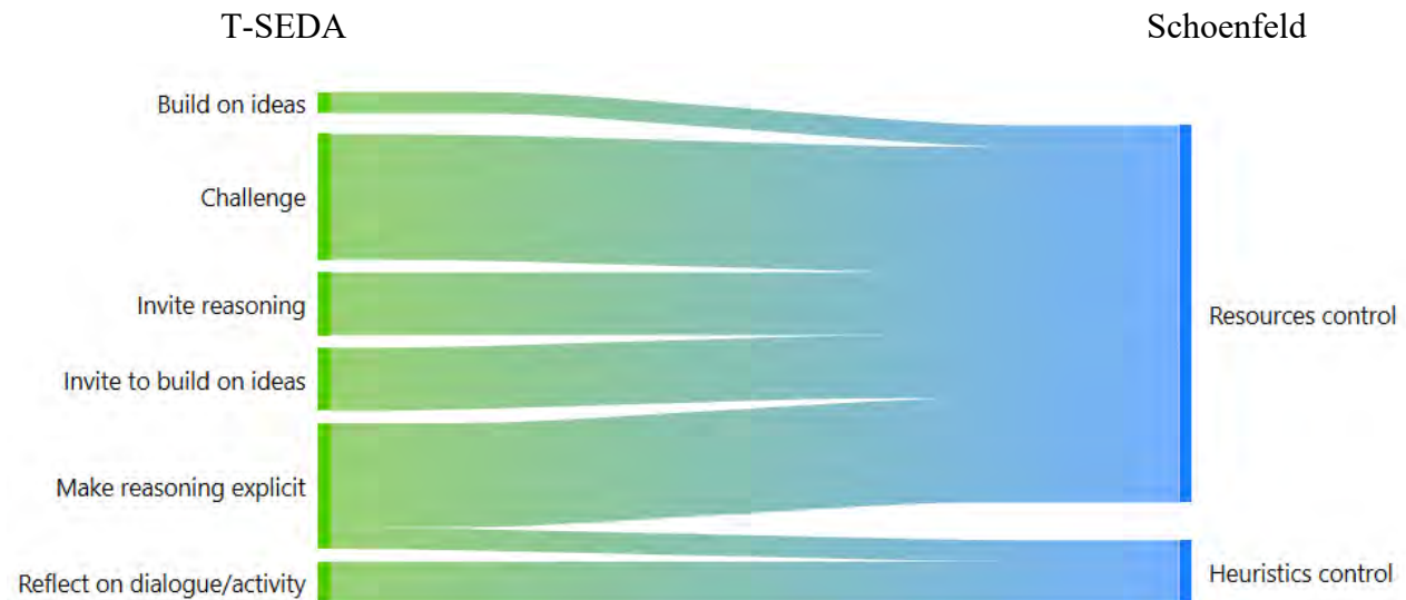
Figure 4: Co-occurrence between the two control codes and six T-SEDA codes