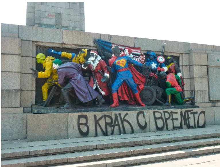
Figure 1.2 Monument to the Soviet Army, Sofia, 18 June 2011. Repainted by anonymous collective.

Other “jamming” strategies make a stronger material mark and, for this reason, are more effective in re-signifying the original and disrupting its power to speak for the public. Examples include the spray-painting of “Black Lives Matter” across the monument to the Confederacy in Charleston in 2015 in an explicit and highly visible contestation of the statue’s claim to speak for society. They also include the colorful repainting of the heroic monument to the Soviet Army in Sofia in 2011 which transformed the soldiers into figures from popular culture in a spectacular act of guerilla art that decommissioned Soviet memory while also offering a playful critique of the ongoing Americanization of Bulgarian society (the same monument was again repainted in 2014 in the Ukrainian colors in condemnation of the Russian occupation of the Crimea).