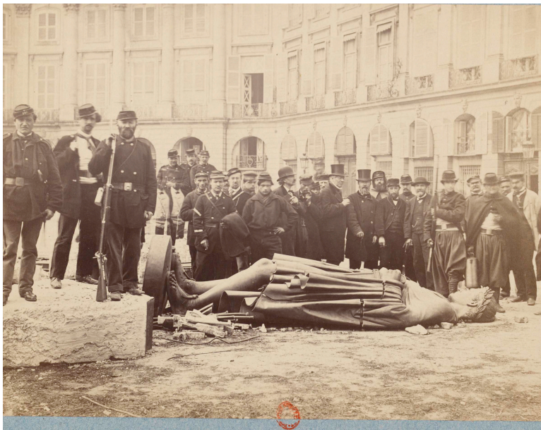
Figure 1.1 Communards posing on the ruins of the Vendôme column, 16 May 1871. Photo: Bruno Braquehais, Commune de Paris, la colonne Vendôme à terre . Courtesy Bibliothèque nationale de France, Paris

Many other examples can be adduced of monuments that ended up provoking anger and object-oriented aggression on the part of new regimes or oppositional movements. Suffice it to mention the swathe of demolitions and relocations of statues to Lenin and Marx that followed on the fall of the Soviet Union at the end of the 1980s; the “Rhodes must Fall”