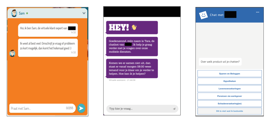
Fig. 2. Anonymized atypical chatbot introductions of two telecom providers (left and middle) and an insurance company (right).

The current section discusses five examples of our sample. These examples were selected as they represent atypical and prototypical chatbot introductions.