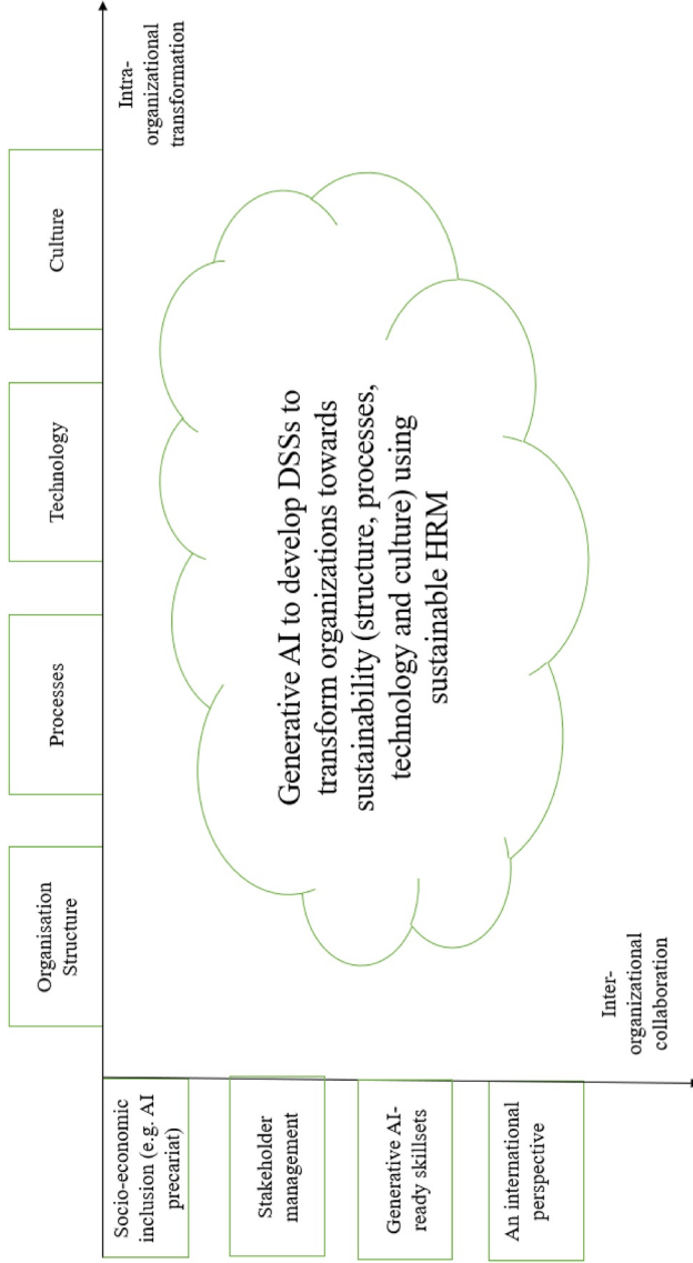
FIGURE 6 Research scope of generative AI to embed sustainability within organizations through sustainable HRM. [Colour figure can be viewed at wileyonlinelibrary.com ]