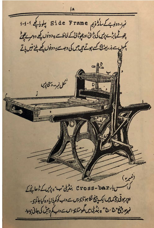
FIGURES 1 AND 2 Virtually identical illustrations of a lithographic hand press in Cumming's and Badāyūnī's respective manuals.