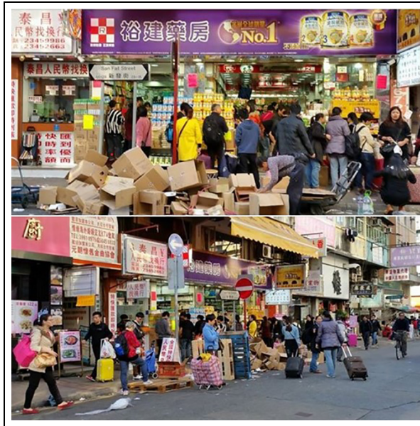
Figure 6. A common street scene in Sheung Shui district, showing many traders in front of a pharmacy.

for traders and jewellery shops have opened up in the former ‘sleepy’ local shopping neighbourhoods. Their ability to pay much higher rent has pushed out other local businesses such as hair salons, stationery shops and small grocery stores. The demand for such ‘Hong Kong quality’ products from traders was at times so high in Hong Kong that shelves were emptied (Figure 6). 7