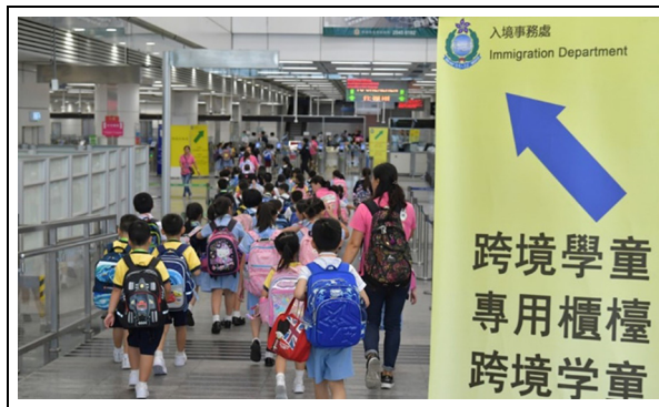
Figure 3. School children at border control point.