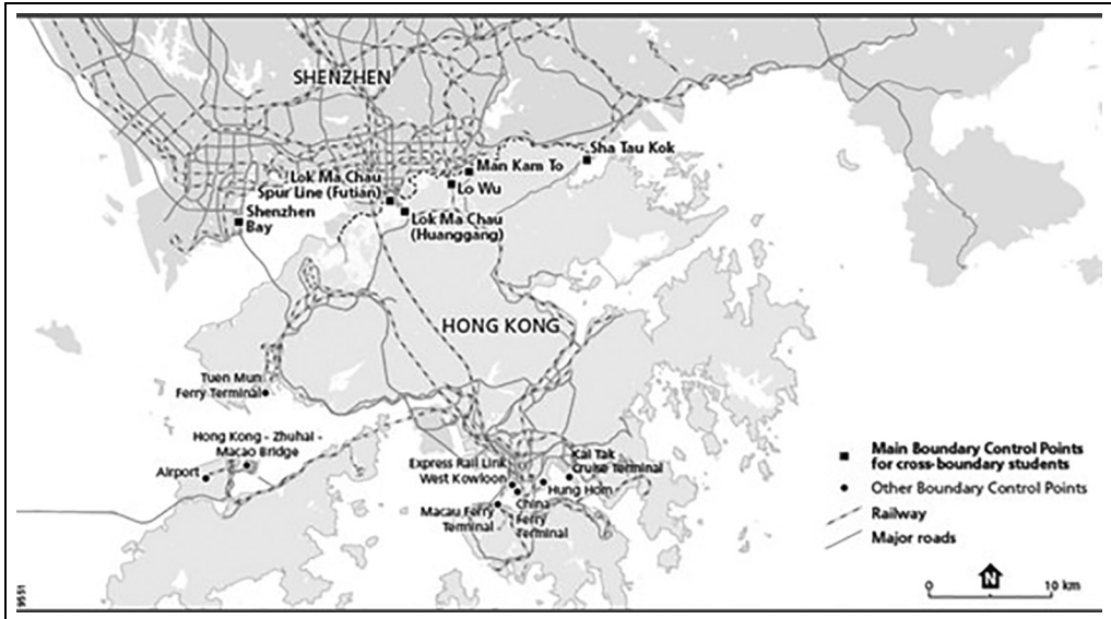
Figure 2. Map of the Shenzhen–Hong Kong boundary and ports.