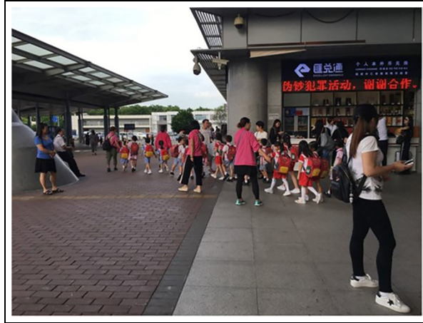
Figure 4. Nannies, in pink tops, at work herding CBS to board the school bus on the Shenzhen side of the border.