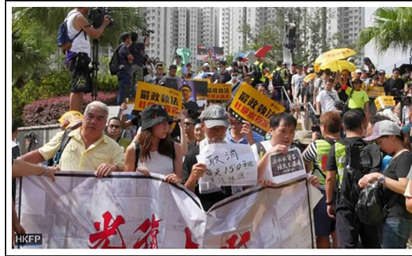
Figure 7. Street protests against, among other things, the impact of parallel trading in Sheung Shui in Hong Kong northern district.