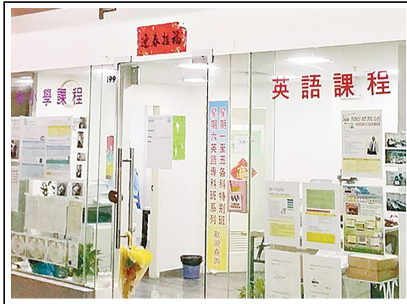
Figure 5. A 'Hong Kong style' tutoring centre in Shenzhen.