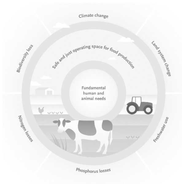
Fig. 1 Determining safe and just operating space for sustainable food systems (De Boer et al., 2019). The operating space for agricultural entrepreneurs is determined by the ecological ceiling (such as nitrogen losses and loss of biodiversity), on the one hand, and by the social foundations, our social values (such as animal welfare and working conditions), on the other

With an animal welfare concept that is responsive to circular agriculture and with an account of circular agriculture that encompasses attention to animal welfare, we