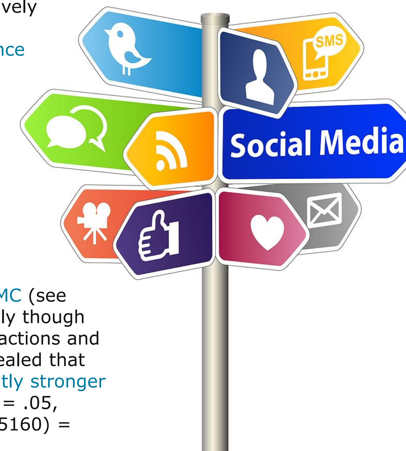
Table 1 Descriptive Statistics for Predictor and Dependent Variables, Correlational Coefficients with Predictor Variables, and Intraclass Correlations (ICCs) and Design Effect Estimates (DEs) for Classroom Level by Dependent Variables (The Netherlands, 2009)

Results of the final multilevel Model 6 (including all fixed and random effects) revealed that use of each substance was significantly and positively associated with EMC (see Table 2). These main effects weakened slightly though remained significant after including FTF interactions and the classroom norm. Additional analyses revealed that the standardized effect of EMC was significantly stronger for alcohol use ( \beta = .15 ) than for tobacco ( \beta = .05 , t(5180) = 3.33 ) or cannabis use ( \beta = .06 , t(5160) = 2.79 , all ps < .01 ).