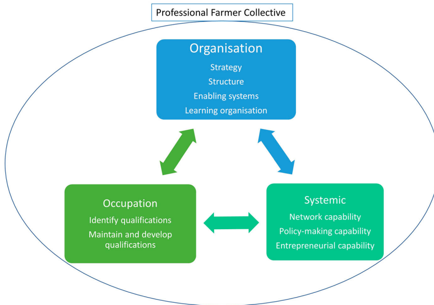
Figure 1. Theoretical framework: three categories and characteristics of the professionalization of farmer collectives.

adjustments can be made or lessons learned from the choices made.