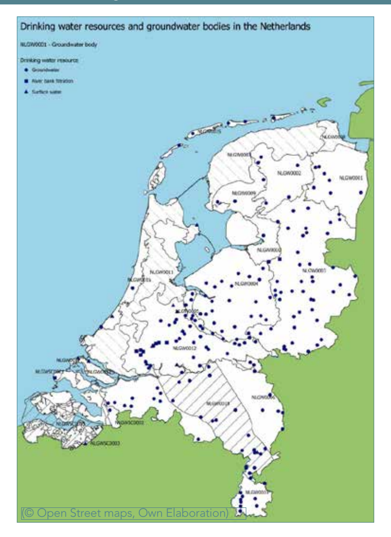
Figure 1. Groundwater bodies and drinking water resources in the Netherlands

The country encompasses the delta of four international river basins: Meuse, Scheldt, Rhine and Ems. The groundwater bodies in this region are part of transboundary aquifers. For drinking water resources, smaller, transboundary catchment areas have been identified (Figure 1). These catchments also have groundwater interactions with smaller regional brooks.