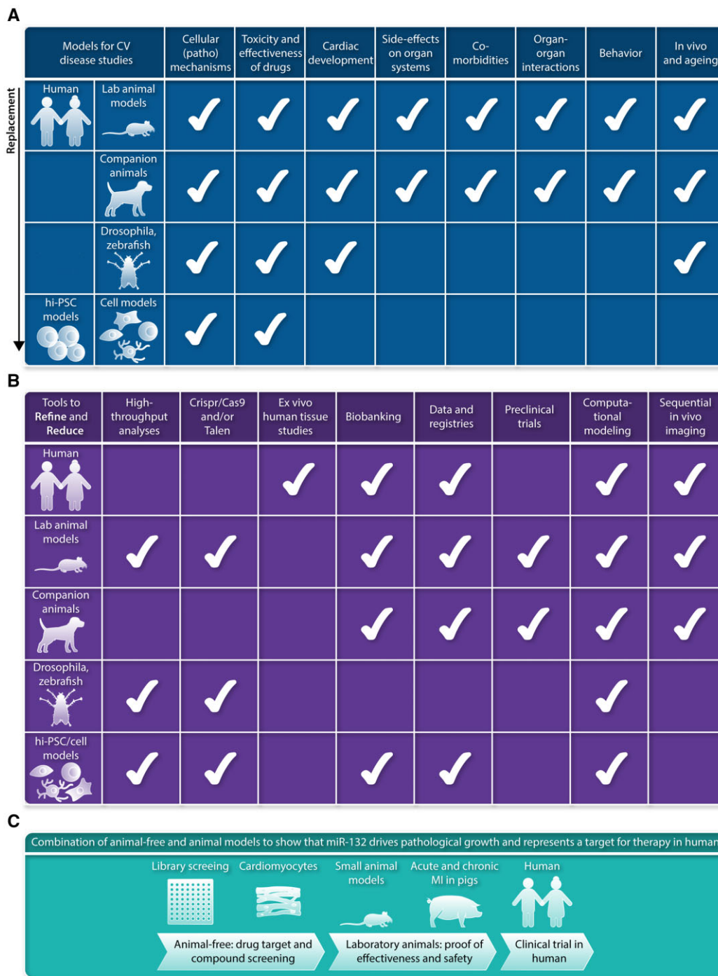
Figure 1 (A) Models that are available for studies on cardiovascular disease, ranging from human and laboratory animals to stem cell-derived models. Aspects that can be measured currently in the different models are indicated with the white check mark. This overview shows that several models allow to reduce the number of studies in laboratory animals, as many initial steps in identification of pathomechanisms, testing drug toxicity and drug effectiveness can be studied in cell-based models. Clearly, studies in human itself offers multiple opportunities to reduce the work in laboratory animals. (B) Multiple tools have been developed in past years to refine and replace studies in the models used for cardiovascular research, and range from tools and expertise to characterize human tissue samples obtained during surgery to models derived from hiPSCs (human induced pluripotent stem cells). (C) Example of an experimental design making use of available complementary research models based on the 3R principles. 2

pathways triggered by the initial cardiac injury. This includes CM remodelling and alteration of metabolism, followed by progressive LV dilatation (eccentric remodelling), associated with extensive remodelling of the