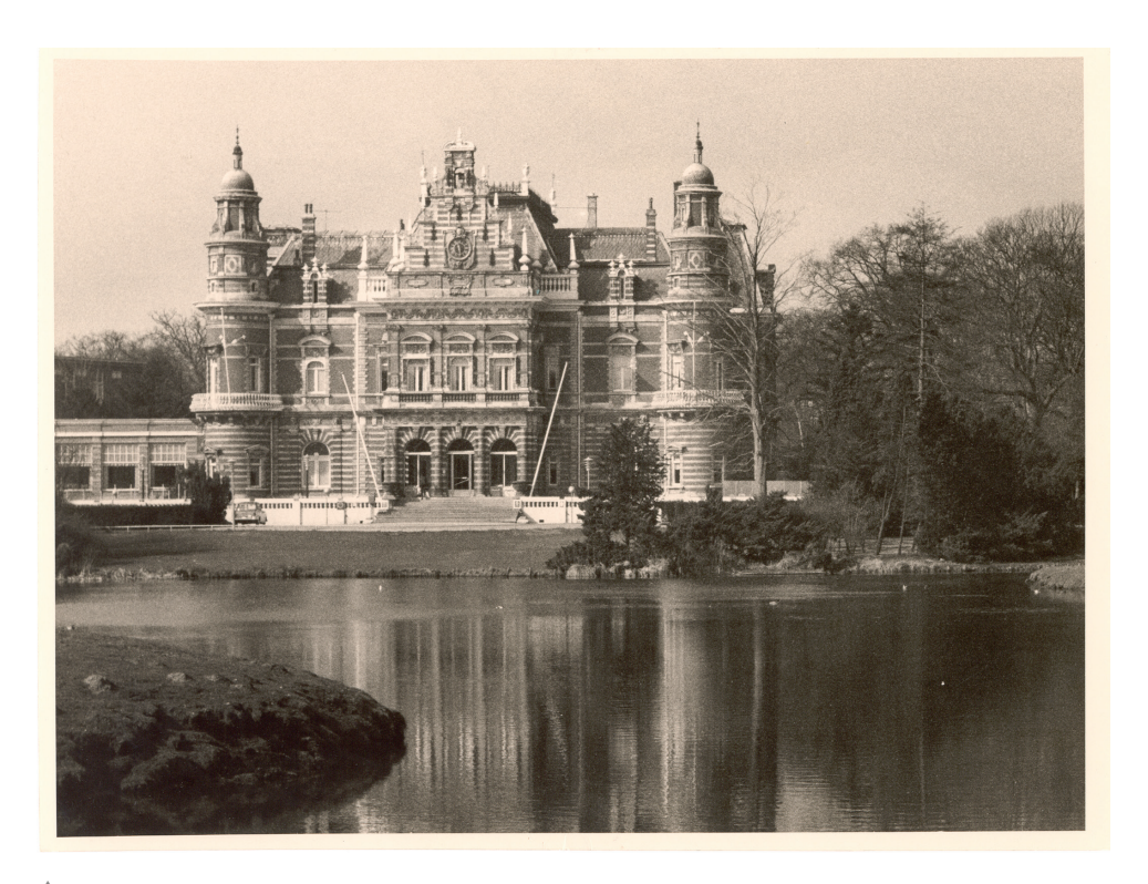
Kasteel Oud-Wassenaar, where the negotiations between West German, Israeli and JCC representatives took place.