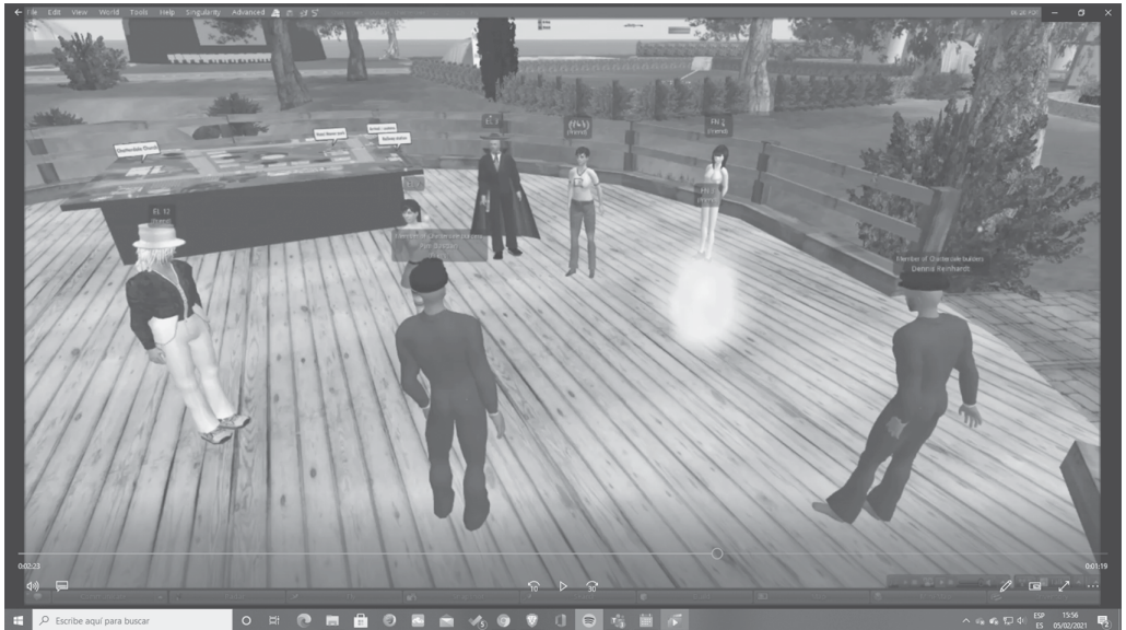
Figure 23.1 Students as Avatars Carrying Out Virtual Exchange Tasks in OpenSim