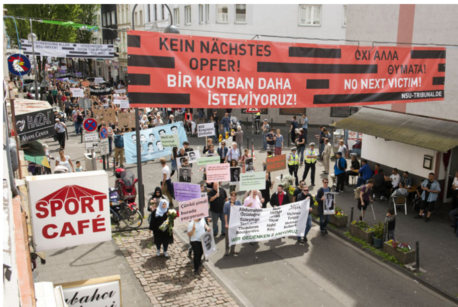
FIG. 3. The Tribunal NSU-Komplex auflösen in 2017 went from the theatre space on to the streets to demonstrate under banner 'No next victim!' in reference to the communities' 2006 protest Kein 10. Opfer .

video reinvestigated the testimony video and focused on the activities during the nine minutes and twenty-six seconds at the crime scene only, this mural captured the temporal, social and political complexity of the wider story at stake. The mural included the trial in Munich; national parliamentary inquiries; civil society, including commemoration ceremonies; protest marches; and anti-racist activism against police discrimination and the Tribunal NSU-Komplex auflösen. Cultural institutions such as documenta, and media reports with their discriminatory framing of the case's victims and relatives, were also part of it.