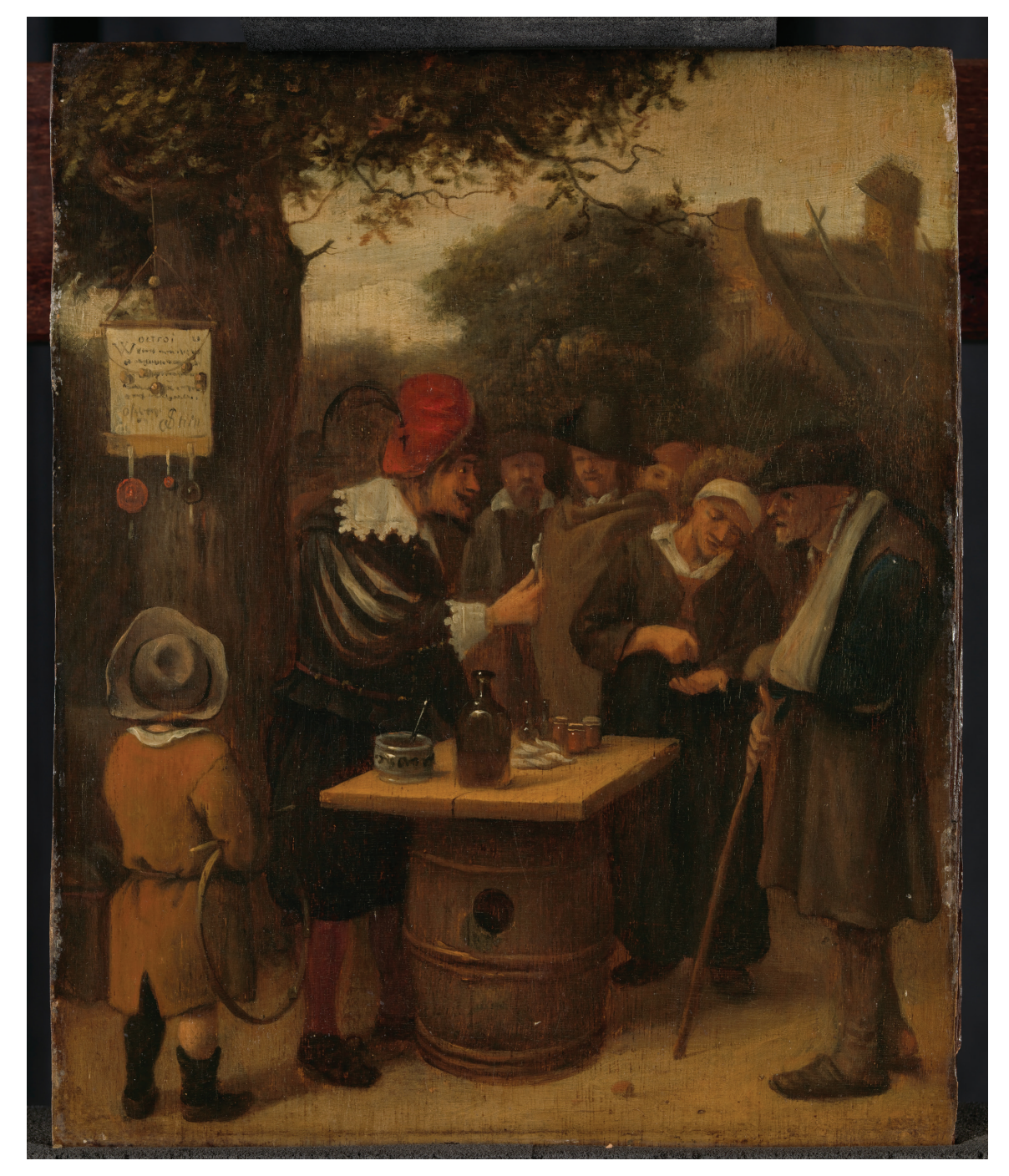
Image 1: The quack , attributed to Jan Havicksz. Steen (1650–1679) (Oilpainting on panel). We see a "quack" promoting and selling his pills and potions. On the tree behind him hangs a document with several seals. We can read the word "Octroi," which means "permit," implying that he had an official license for his activities. (Rijksmuseum Amsterdam SK-A-392).

Despite their established position in the regular Amsterdam medical marketplace, they still needed these announcements to inform their potential customers.