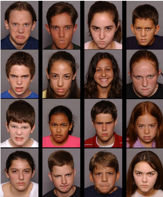
Fig. 2 The children's version of the Visual Search Task (VST) [23]. Example stimulus display where the target is a happy face and distractors are angry faces. Stimuli taken from the NIMH Child Emotional Faces Picture Set [76]

allocated to the 16 positions in the grid. The participants' task was to identify the face showing a certain emotion (i.e., the target) as quickly as possible and click on it with the mouse. Time to identify the target face was not limited. The experiment consisted of four blocks: Two in which happy faces were targets and negative (either sad or angry) faces served as distractors and two in which negative faces (either sad or angry) were targets and happy faces were the distractors. Each block comprised 32 trials with the target appearing twice in each position and being twice each model. The order of trials within the blocks as well as the order of blocks was random. Before each block, participants completed three practice trials to familiarize themselves with the task.