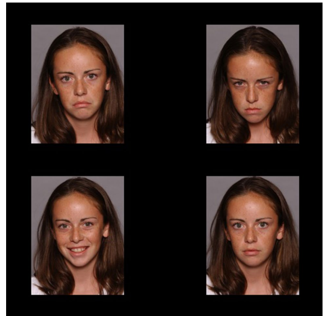
Fig. 3 An emotional trial of the children's version of the Passive Viewing Task (PVT) [50]. Stimuli taken from the NIMH Child Emotional Faces Picture Set [76]

As a purely ET-based measure of AB, a PVT [50] was also administered. Each trial began with a drift correction. A fixation cross followed for 1000 ms. Then the 2 \times 2 stimulus array was presented for 15000 ms. The task consisted of 16 emotional trials (corresponding to the minimum trial number suggested for ET research suggested by Orquin and Holmqvist [80]) and eight neutral trials (not analyzed) that were presented in random order. In the emotional trials,