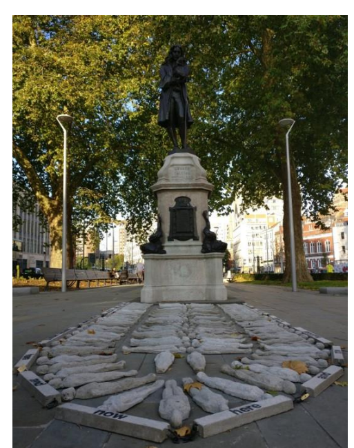
Figure 6 : Installation, Anti-slavery Day, Bristol, UK, 18 October 2018.

in the city's M Shed museum (2018). The national Anti-Slavery Day (inaugurated in 2010) also regularly provided an occasion for memory activism, including most notably an installation from 2018 which highlighted Colston's complicity with the slave trade by adding the outlines of a slave ship to the pavement around the statue: dozens of supine figures were lined up within the boundaries of the virtual hold while a link was established to contemporary forms of slavery through labels such as 'domestic servants' and 'fruit pickers'.<sup>51</sup> The toxic Colston ironically provided a platform for showcasing these alternative perspectives on the past and present of the city in ways that were more arresting, if less durable, than the addition of a revised plaque might have been.