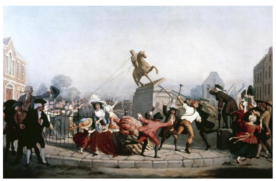
Figure 2: A mob pulls down a gilded lead equestrian statue of George III at Bowling Green, New York City, 9 July 1776. Painting William Walcutt, 1854.

It starts by noting that there is nothing new about iconoclasm. Surprising as it may seem given their reputation for durability, monuments are in fact routinely subject to being relocated, demolished, and reworked into new objects.