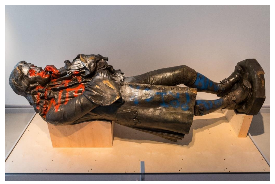
Figure 9: Statue of Bristol slave trader Edward Colston, M Shed museum, Bristol, UK, 4 June 2021.

Displayed in this way, alongside some of the posters left by protesters, it has become a historical curiosity rather than an irritant in the public space. Although the removal of the statue led to some kickback on the part of counter-protesters who saw it as an assault on their heritage and identity,55 as well as kickback from the conservative government who has since introduced legislation that envisages severe punishment for damage to statues, the Bristol City Council has taken no moves to have the statue reinstated. In the meantime, a commission set up under its auspices has recommended that the statue be kept in the museum.<sup>56</sup>