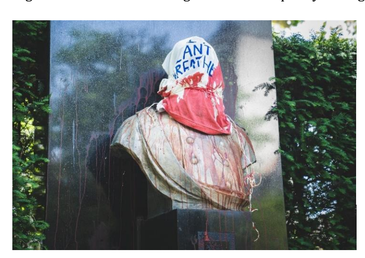
Figure 1: Vandalized Monument to King Leopold II, Ghent, Belgium, 2 June 2020.

In recent years, monuments relating to the legacy of European colonialism have been the subject of very visible public controversies across the world. Starting with the highly mediatized "Rhodes must Fall" movement in South Africa in 2015, multiple 'must fall' movements have been targeting public expressions of the historical domination of Europeans over brown and black people. To date more than 190 statues to the Confederacy have been removed across the United States (94 of them following the murder of George Floyd in 2020).¹ In Mexico City, as in many other locations across Latin America, the statue to Christopher Columbus has been removed after protest by indigenous activists.² In Canada, a monument to Queen Victoria was upended in Winnipeg as one among many attacks on symbols of the oppression of indigenous peoples.³ In Belgium, King Leopold II's bust was removed from a park in Ghent in June 2020, while his statue in Brussels has become a site of regular demonstrations for greater racial equality in Belgium.