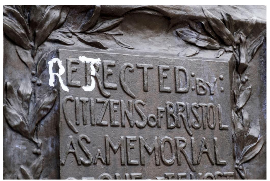
Figure 8 : Reworked plaque of the Colston monument, 11 June 2020.

At the time of writing (June 2022), a decision has yet to be taken on the future of the empty pedestal (so far the gravitation has been towards temporary installations that avoid the risk of becoming anachronistic).<sup>53</sup> The day after the statue was dumped in the harbour, it was retrieved by the city authorities. Since June 2021, it has been relocated to a local museum – now in a horizontal position and still carrying the paint thrown at it by the protesters on the same afternoon it was taken down both literally and figuratively from its pedestal.<sup>54</sup>