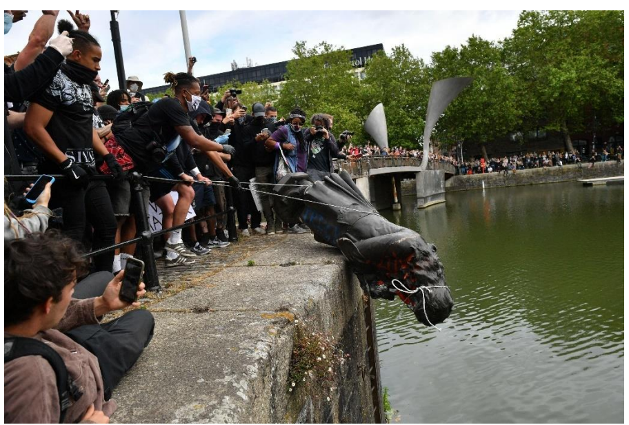
Figure 4 . Demonstrators throw the statue of Colston into Bristol Harbour, UK, 7 June 2020.

the toppling was positioned, and then use the case to ponder further how mnemonic regime change relates to social transformation.