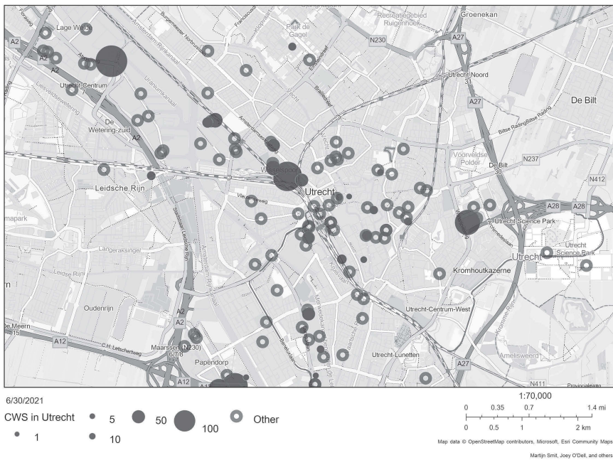
Figure 12.1 CSs in and around the city of Utrecht. Data gathered under the guidance of Veronique Schutjens and Martijn Smit by Casper Leerssen, Joey O'Dell, and six other students; situation as of June 2021. Each grey circle indicates a CS and the size of the circle corresponds to the number of spots offered; open circles represent CSs with an unknown number of spots.

Weijjs-Perrée et al. (2019) point in this direction and see an important push factor in the Netherlands, where there is a large demand for space outside the home, since houses are generally small.