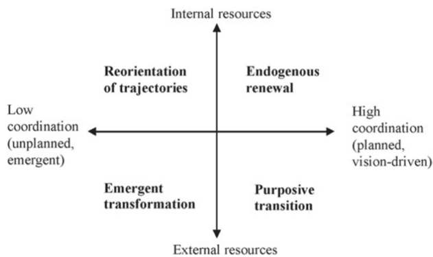
Fig. 1 Typology of responses (Berkhout et al. 2004, p. 67)

(Loorbach 2007; Pelling 2011). The ability of the governance network to understand and respond to systemic change is therewith a critical determinant for the dynamics and outcome of transitions.