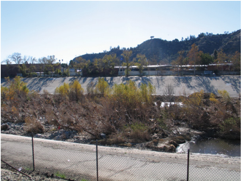
FIGURE 2 The Los Angeles River in the Glendale Narrows (photo by Valentin Meilinger, January 2018)