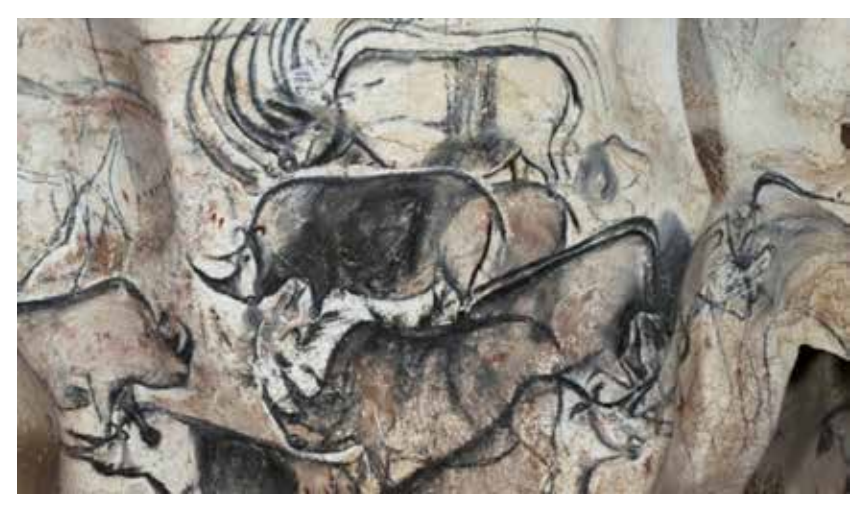
15. Detail of layered images of running animals, visualizing movement by overlaying images in 'difference'.

visual boasting. Moreover, it is an example of those media practices that address questions about space and mobility.