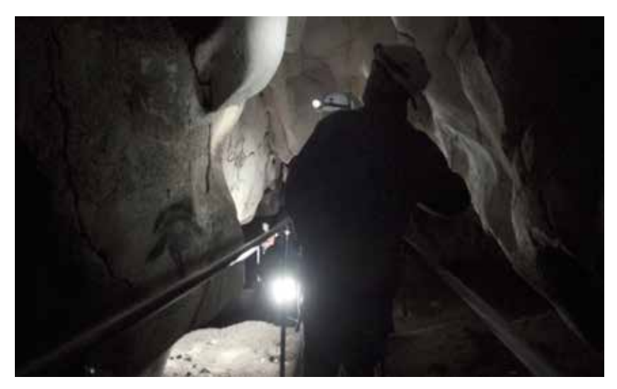
13. Highly intimate shot of the camera that follows the explorers on the narrow pathways, bringing the camera close, yet at a careful distance, to the contours and curves of the painted rock surface.

a fashion that, indeed, may warrant the tweaking of McLuhan's canonical phrase into 'The Medium is the Method'. 19