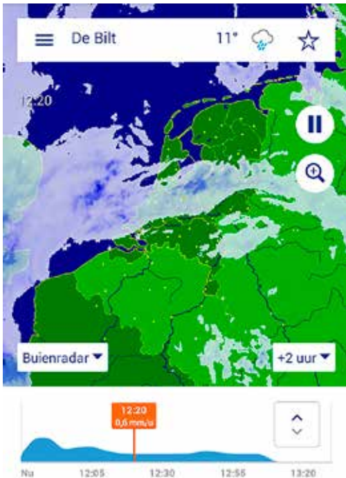
Figures 5.1 and 5.2. Default views for the Buienradar website and (Android) app for Monday April 30, 2018 at around 11:35 a.m. CET.