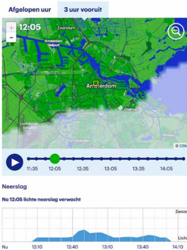
Figure 5.4. Shower radar and rain graph visualizations on the Buienradar website, set to Amsterdam, for Monday April 30, 2018, 11:35 a.m. CET. Screenshot by Eef Masson, used under quotation exception. Copyright 2006-20 by RTL Nederland.