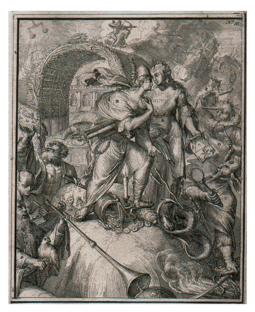
Figure 4. Plate 35, Van de Vrede van Gods Kerk (on the Peace of God's Church), in Romeyn de Hooghe, Hieroglyphica . Private collection.

For the study of early modern Dutch religion, the etchings in Hieroglyphica are a unique source. Besides the portraits of theologians and images of church buildings, we actually do not have much pictorial material to study [33] (pp. 22–27). I am struck time and again by the ways De Hooghe captured the then current discourse on religion in his images. Plate 35 in Hieroglyphica depicts the Peace of God's Church, very probably a reference to the only recently issued resolution towards the peace of the church [31] (pp. 326–333). The central figures in this etching are the Peaceful Church (A) and her industrious sister Free Inquiry (B), who also stands for the body of the faithful. The Peaceful Church, the true Bride of Christ, can be free of internal strife and schism because she allows her members a Christian freedom to search the divine mysteries contained in the Holy Scriptures. Free Inquiry wears the hat of liberty, and at her feet lie old coins and a set of compasses, symbols for the study of antiquity and scientific measurements. She tramples a tiara, the emblem of the Papacy.