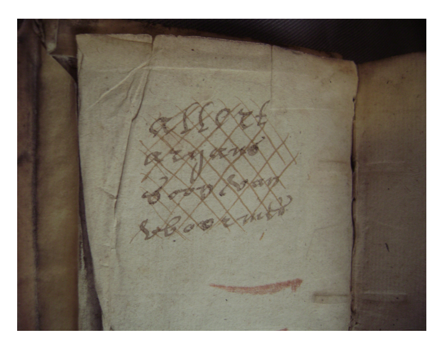
Figure 2. Owner's inscription in the first edition of De Witte's Wederlegginge , fly leaf, UB Leiden, shelf mark 55 H 16.