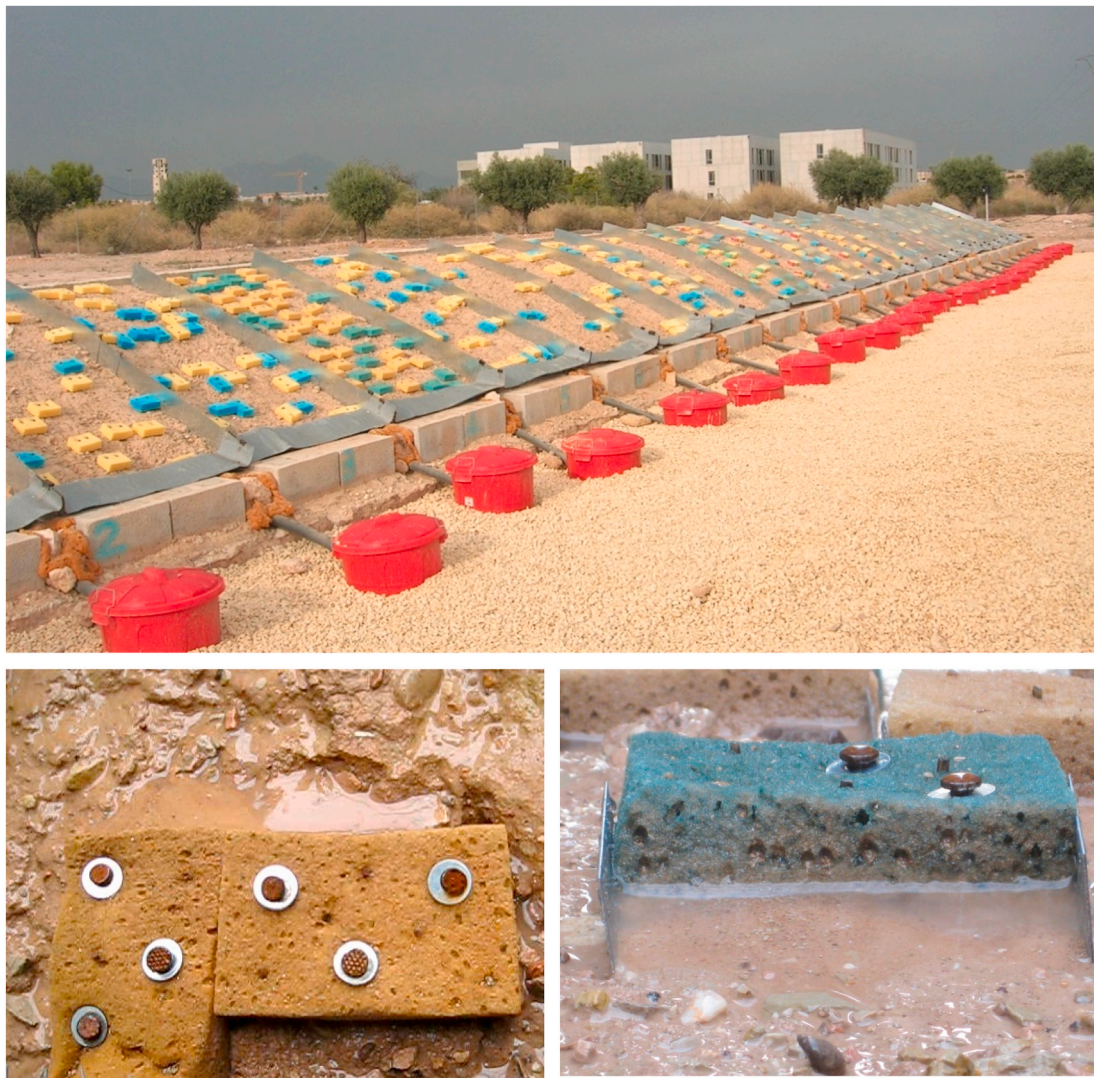
Fig. 1. General view of the experimental setting (top) and details of the upslope side of no-sink (bottom left) and sink-mode (bottom right) patches during simulated-rainfall runs.