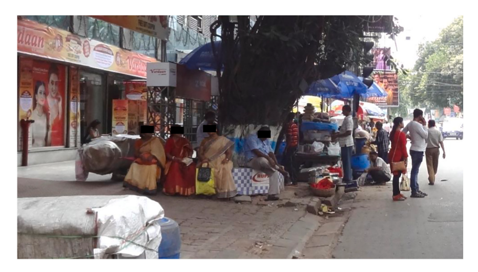
Fig. 2. A group of women sitting in front of Vardaan Market in Camac Street, Kolkata.

imparted a sense of safety amongst them. As one of the participants residing in Santoshpur said,